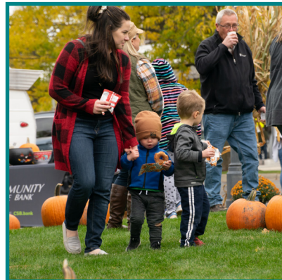
CSB Community Pumpkin Patch October 2022